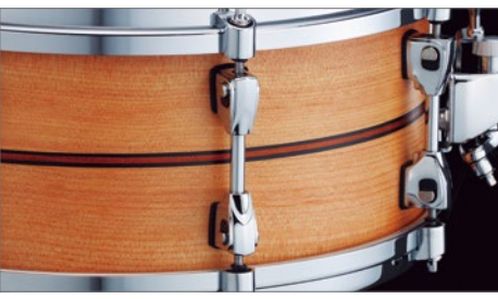
Brown Finished Inlay