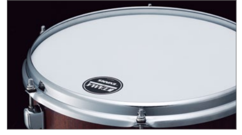
Sound Arc Hoop (6 hole)