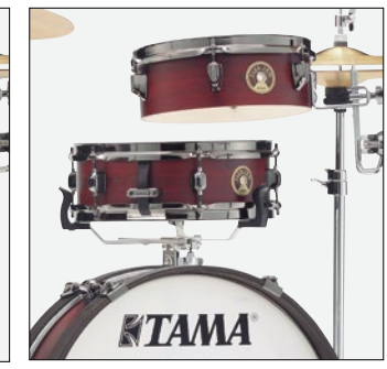
Burgundy Walnut Wrap (BWW)