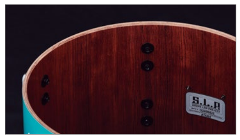
6.0mm, 9ply Bubinga Shell

Shell: 6.0mm, 9ply Bubinga Size: 12"x7" Hoops: Sound Arc Hoop (6 hole) Batter side: 2.3mm Snare side: 1.6mm Lugs: MSL-SCT Strainer / Butt: MLS30A/MLS30B Snare Wire: Starclassic 20-strand Carbon Steel Snare Wires Head: Evans® Genera Dry / Evans® Snare Side Finish: Electro Turquoise (ETQ)