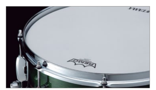
Customized Brass Mighty Hoop (8 hole)

6.0mm, 8ply Mahogany Shell w/ 6.0mm Sound Focus Rings