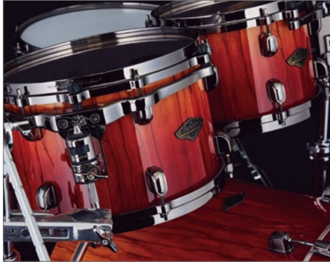
Black Nickel Shell Hardware