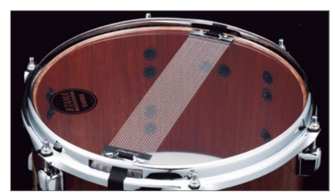
20-strand Carbon Steel Snare Wires