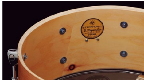
8.0mm, 9ply Spruce Shell

Shell: 8.0mm, 9ply Spruce Size: 14"x6" Hoops: Grooved Hoop Lugs: Freedom Lug Strainer / Butt: MLS50A / MLS50B Snare Wire: Super Sensitive Hi-Carbon Snare Wires (MS20RL14C) Head: Evans® G1 Coated / Evans® Snare Side Finish: Satin Natural Spruce (SSC)