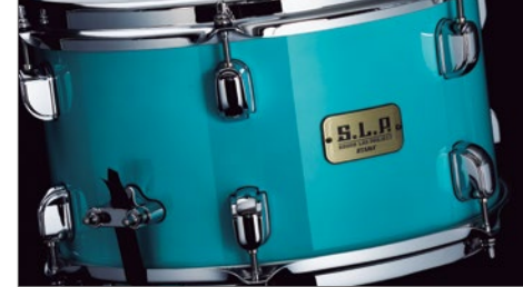
Electro Turquoise (ETQ)