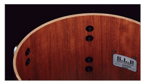
6.0mm, 9ply Bubinga Shell

Shell: 6.0mm, 9ply Bubinga Size: 12"x7" Hoops: Sound Arc Hoop (6 hole) Batter side: 2.3mm Snare side: 1.6mm Lugs: MSL-SCT Strainer / Butt: MLS30A/MLS30B Snare Wire: Starclassic 20-strand Carbon Steel Snare Wires Head: Evans® G1 Coated / Evans® Snare Side Finish: Satin Bubinga (SBG)