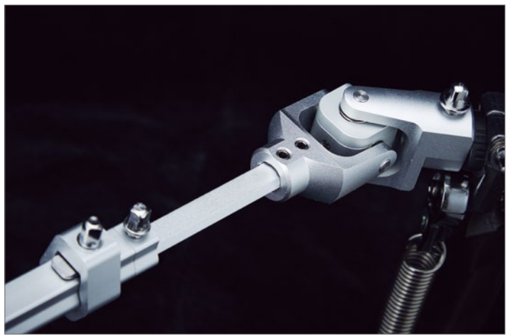
Zero Latency with Ball Bearings