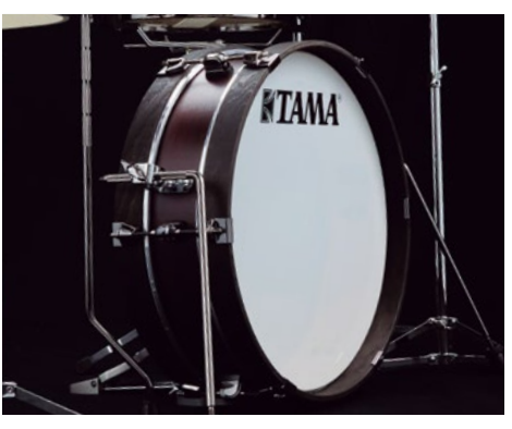
Vintage Inspired Bass Drum Hoop