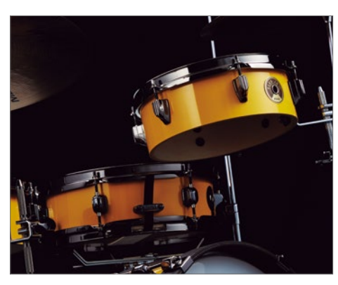
Black Nickel Shell Hardware