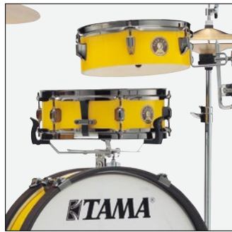
Electric Yellow (ELY)