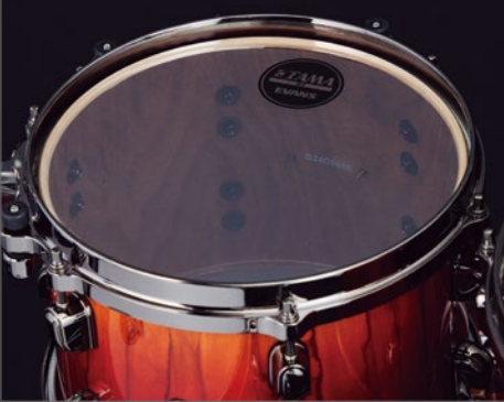
Shell: TT/FT/SD: 6mm, 4ply Birch + 1 outer ply Bosse Fonce + 2 inner ply American Black Walnut

BD: 8mm, 5ply Birch + 1 outer ply Bosse Fonce + 2 inner ply American Black Walnut