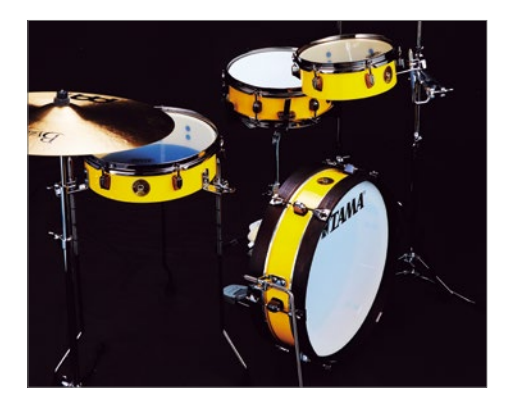
Ultra-Shallow Pancake Shell

Including: 18"x4" bass drum 10"x3.5" tom tom 13"x3.5" floor tom 12"x4" snare drum single tom attachment