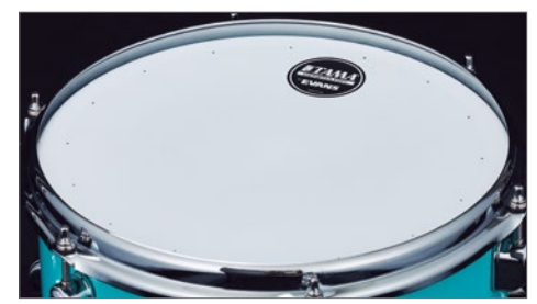
Evans® Genera Dry Drumhead