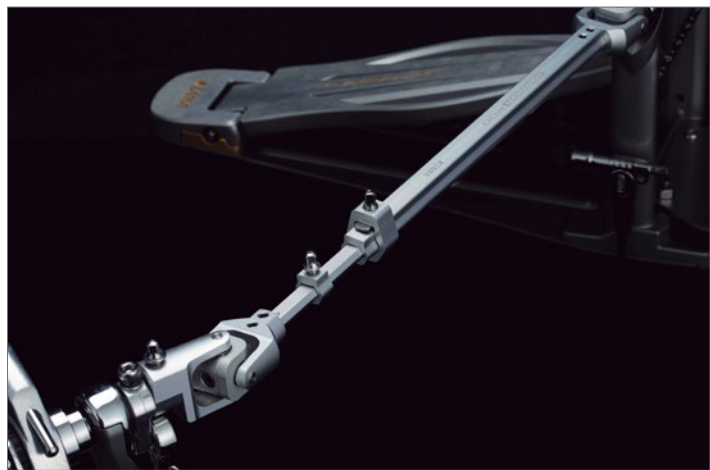
Easy & Quick Setup / Memory Lock