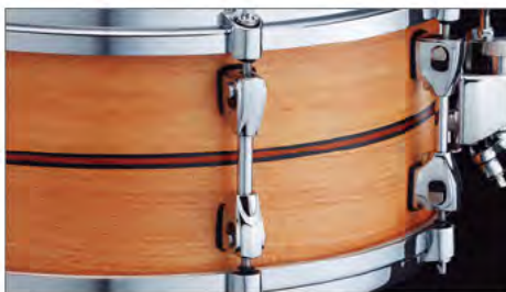
Brown Finished Inlay