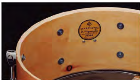
8.0mm, 9ply Spruce Shell