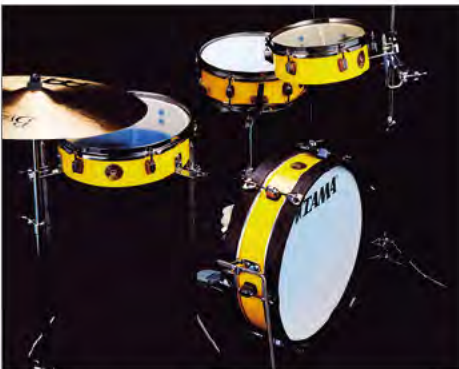
Ultra-Shallow Pancake Shell