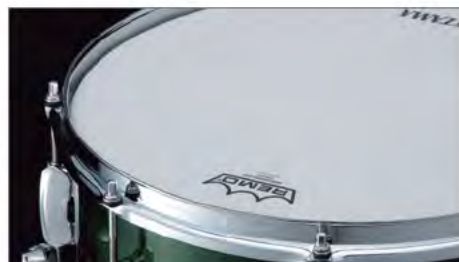
Customized Brass Mighty Hoop (8 hole)