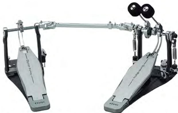
HPDS1TWMR Rikt.inkl.moms: 10595:-

The Mirror Rod Special Bundle Pack is a limited edition package that combines the overwhelmingly smooth Mirror Rod with Iron Cobra, Speed Cobra, or Dyna-Sync Pedals.