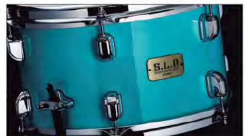
Electro Turquoise (ETQ)