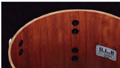
6.0mm, 9ply Bubinga Shell