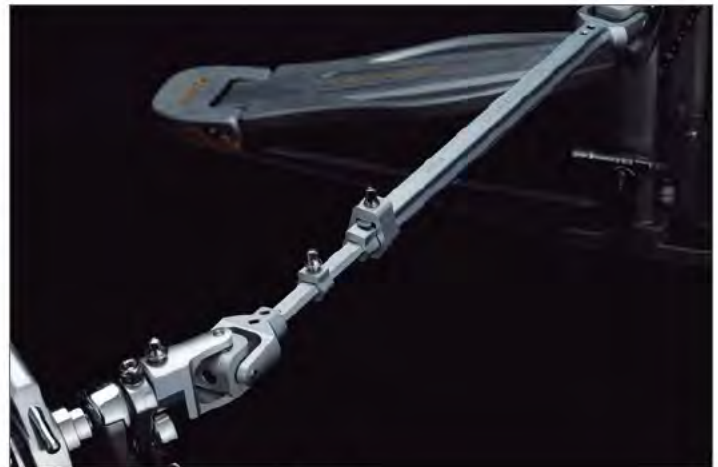
Easy & Quick Setup / Memory Lock