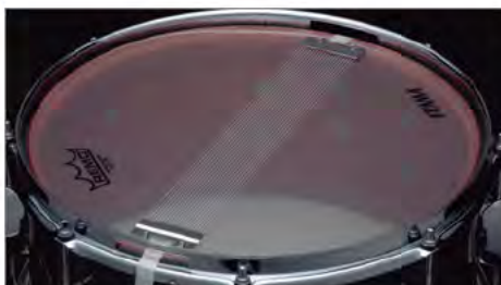
20-strand Carbon Steel Snare Wires