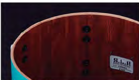
6.0mm, 9ply Bubinga Shell