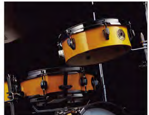
Black Nickel Shell Hardware