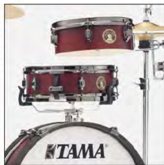
Burgundy Walnut Wrap (BWW)