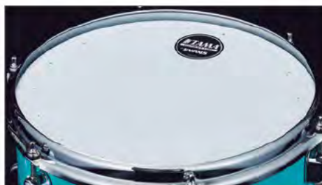
Evans® Genera Dry Drumhead