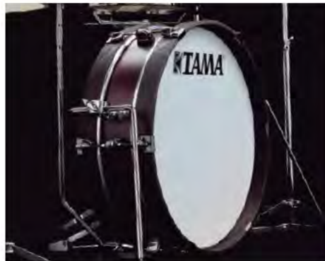
Vintage Inspired Bass Drum Hoop