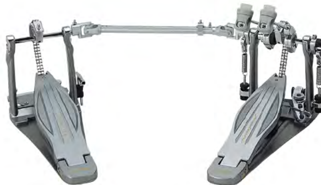
HP910LWNMR Rikt.inkl.moms: 8675:-