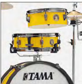
Electric Yellow (ELY)