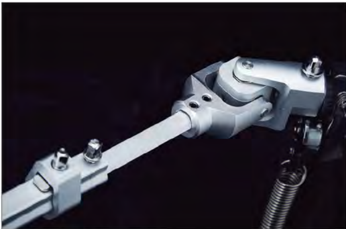
Zero Latency with Ball Bearings