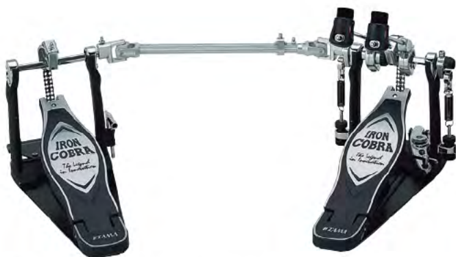
HP900PWNMR Rikt.inkl.moms: 8675:-