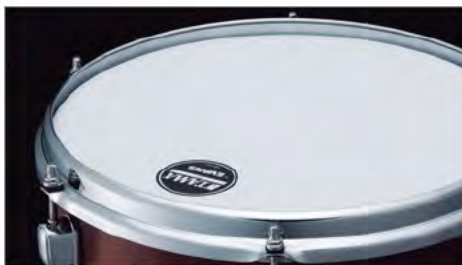
Sound Arc Hoop (6 hole)