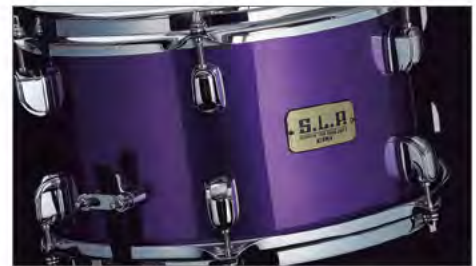
Galactic Purple (GPP)