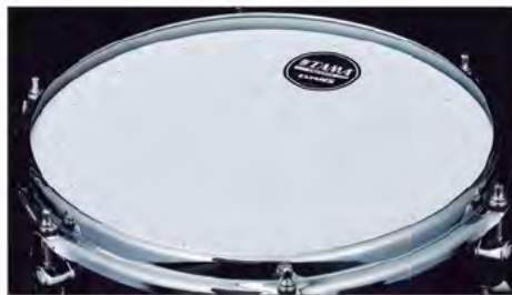
Evans® Heavy Duty Dry Drumhead