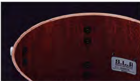
6.0mm, 9ply Bubinga Shell