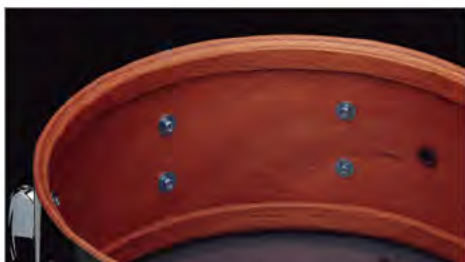
6.0mm, 8ply Mahogany Shell w/ 6.0mm Sound Focus Rings