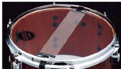
20-strand Carbon Steel Snare Wires